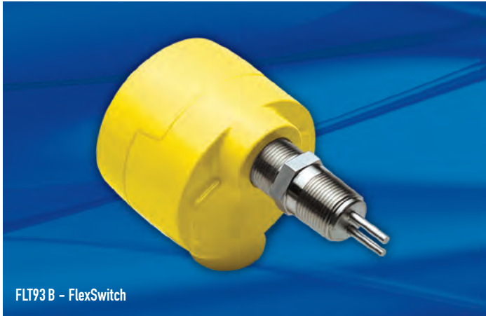
FLT93 B - FlexSwitch

Model FLT93B is a preconfigured version of FCI's Model FLT93S in its most popular configuration for simplified ordering and off-the-shelf quick shipment. For additional application and installation requirements, consult FCI's complete FLT93 Series brochure and ordering guides.